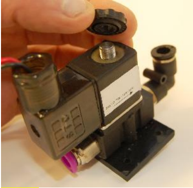
Step 1: Remove the black finger nut holding the electromagnet portion of the solenoid.