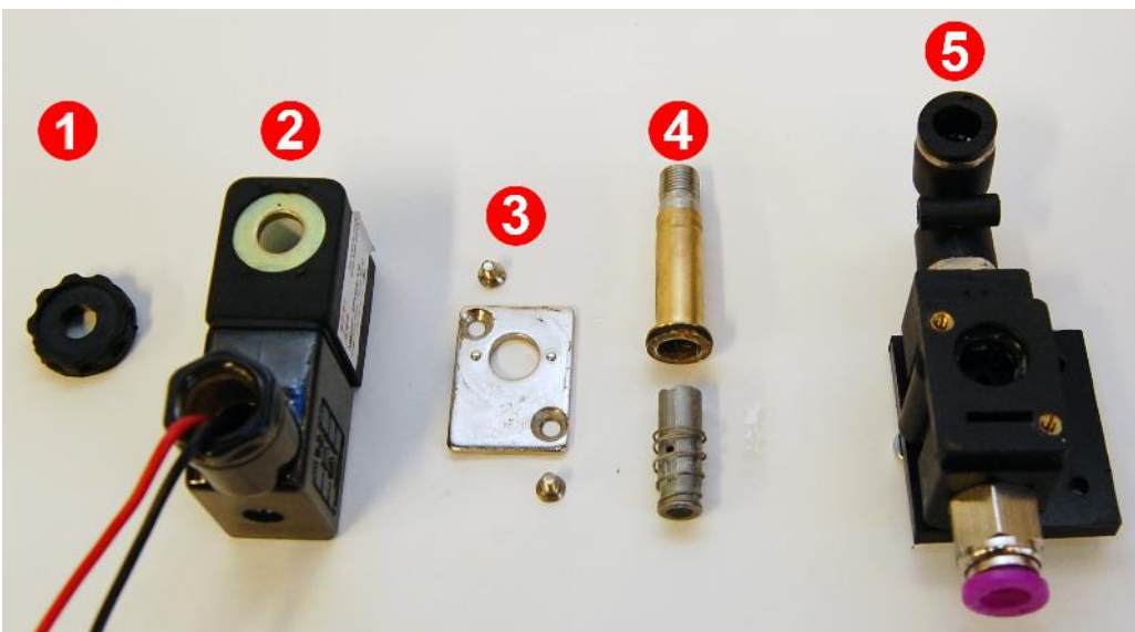
Step 8: The picture to the left shows the disassembly process from Left to Right (#1 - #5). Thoroughly clean all components with Viper Anti-Venom Maintenance Solution. Especially check the bottom of the piston spring and the port the piston sits in. When re-assembling, the parts stack on top of each other in the reverse order they were removed.

When putting the spring back into the piston, ensure it is correctly placed as seen in the picture to the left (#4).