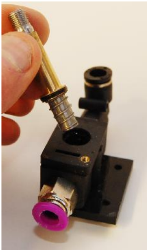
Step 5: Remove the piston and spring assembly.