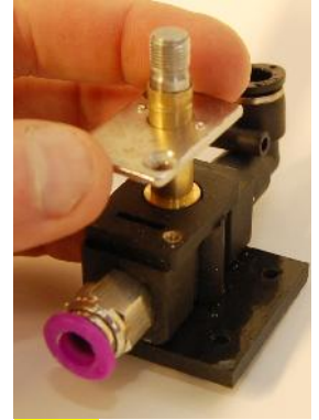
Step 4: Remove the piston cover plate.