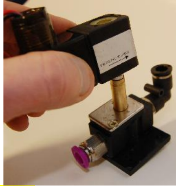
Step 2: Remove the electromagnet.