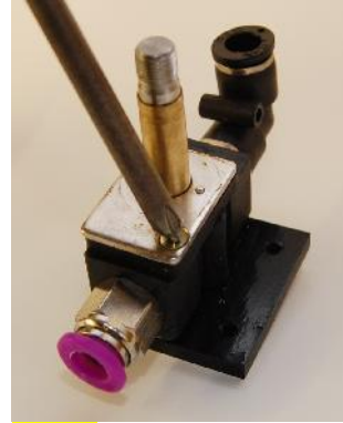
Step 3: Unscrew the two bolts holding the piston cover plate in place.