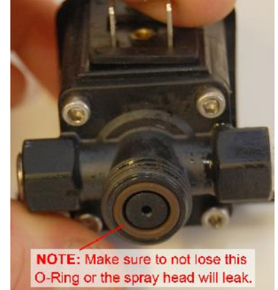
Step 3: Make sure to not lose the O-Ring (it may stick to the nozzle tip) when disassembling the unit.