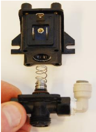
Step 4: When separating spray solenoid, note the piston and spring position in the piston shaft.