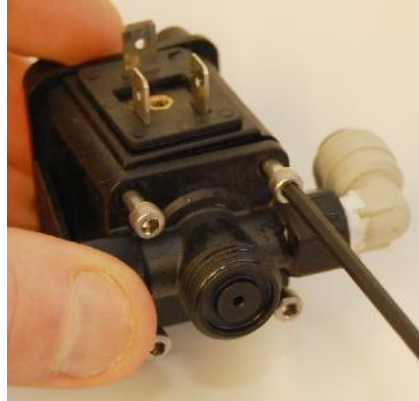
Step 2: Using a 7/64" hex wrench remove all 4 bolts that hold the spray head solenoid together.