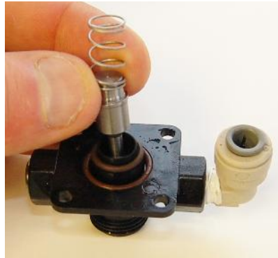
Step 5: Remove the piston and spring from the lower portion of the spray head and clean the piston, spring and inside the plastic housing.