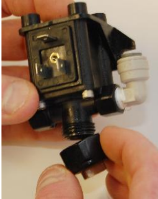
Step 1: Remove the black spray tip nut that holds the spray tip against the solenoid.