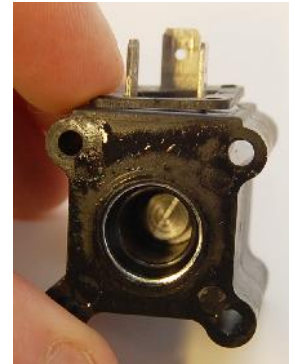
Step 6: Also clean the top electromagnetic housing of the spray solenoid.