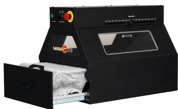
ViperONE Pretreatment Machine