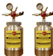
2 Two Quart Pressure Container